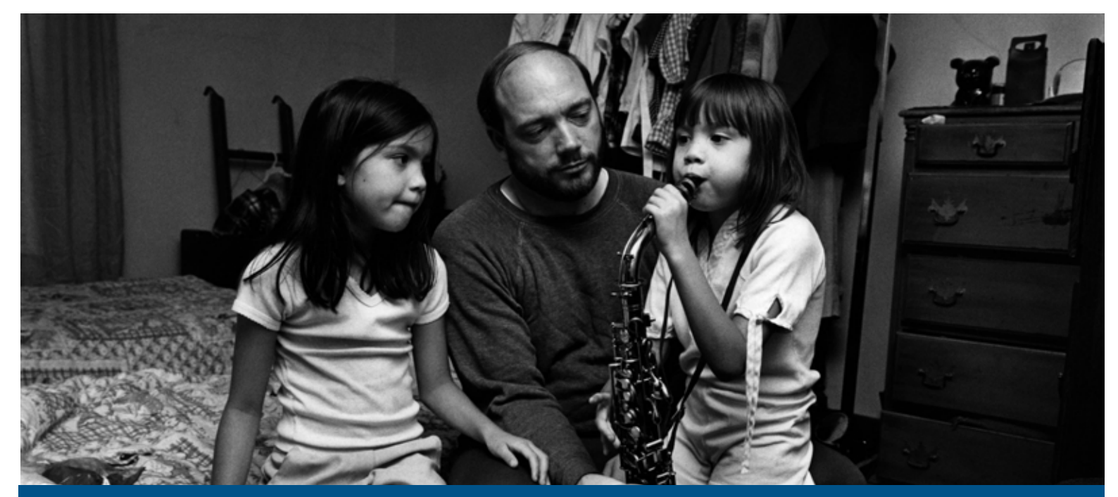
Padres Unidos: Partnering with Parents for Prevention – Sonoma County's Story